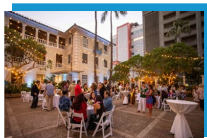
Friends, staff and supporters of ESH gathering to celebrate