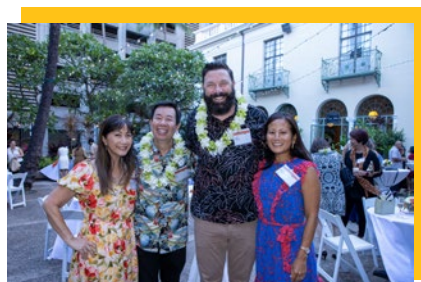
ESH Board members - past and present - and supporters having fun

In honor of our 75th anniversary, we're fundraising to support our adult programming and services. Local support is what helps bring great programs like these to new heights, raising awareness and building a more inclusive world. Our community of supporters and funders enables the dedicated team of practitioners to provide the exceptional, individualized, family-centered services that empower people with disabilities or special needs to achieve their goals and live independent, fulfilling lives.